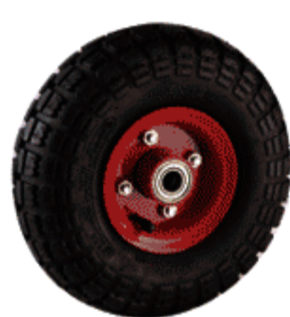
風輪(烤漆鐵框) Pneumatic with painted steel rim