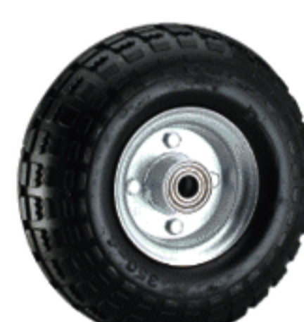
風硬輪(鍍鋅鐵框) Solid Rubber wheel with plated steel rim