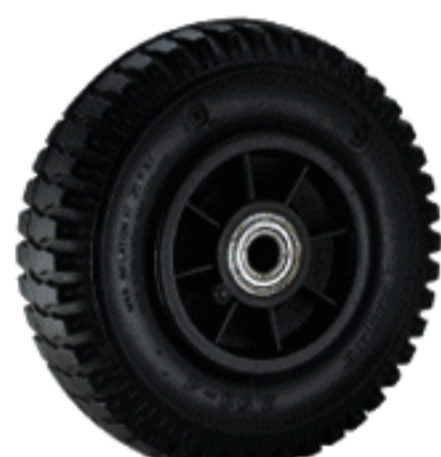
風輪(塑框) Pneumatic with plastic rim