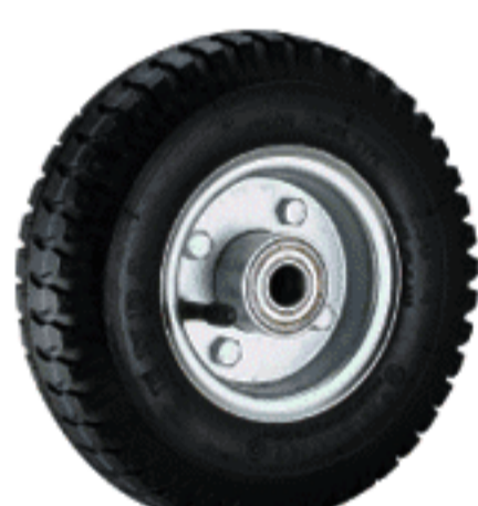
風輪(鍍鋅鐵框) Pneumatic with plated steel rim