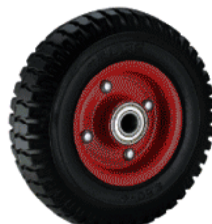
風硬輪(烤漆鐵框) Solid Rubber wheel with painted steel rim