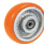
XPU on Iron Core