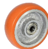
XPU on AL Core