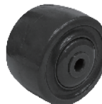
King Kong Wheel

*Other Anti-Static Wheels Available, Please Contact The Factory