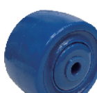
King Kong Wheel