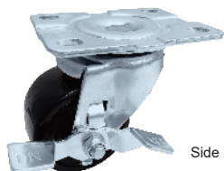
Side Lock Brake