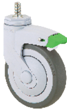
定向刹 Directional Lock Brake