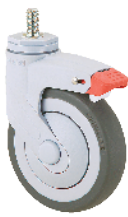
双刹 Total Lock Brake