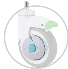
无磁脚轮 Magnetic Free Caster

*图片仅供示意, 请以实际产品为主 *Images are for illustrative purposes only. Please refer to the actual product.