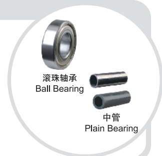
滚珠轴承 Ball Bearing