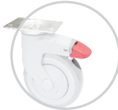
长踏板 Long Pedal