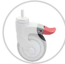
超长踏板 Extra Long Pedal