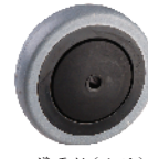
導電輪(小弧) E-Conductive (Crown Surface)