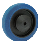
藍色彈力全效輪 Blue Resilient Resolute Rubber