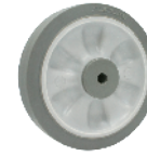
W 全效輪(平面) W Resolute (Flat Surface)