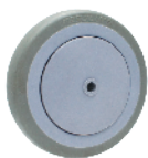
全效輪(小弧) Resolute Rubber Wheel (Crown Surface)