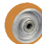
鋁芯ALPU HPU on AL Core