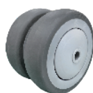
全效雙輪 Resolute(Dual Wheels)