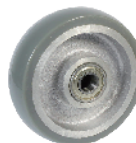
鋁芯ALPU QPU on AL Core