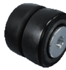
ZQPU輪(抗靜電) QPU(Dual Anti-Static Wheels)