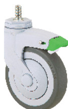
定向煞 Directional Lock Brake