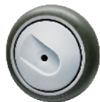
超級人造膠(大圓弧) TPR on PP Core (Dount)