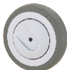
經典超級人造膠 TPR on PP Core