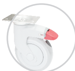
長踏板 Long Pedal