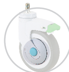
無磁腳輪 Magnetic Free Caster

*圖片僅供示意，請以實際產品為主 *Images are for illustrative purposes only. Please refer to the actual product.