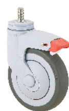
雙煞 Total Lock Brake