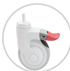
超長踏板 Extra Long Pedal