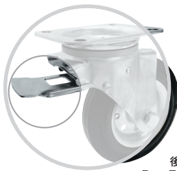
後剎 Rear Total Lock