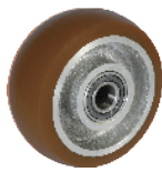
鋁芯AQPU QPU on AL Core