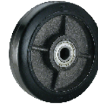
鐵芯NBR橡膠輪(叉車料) NBR Rubber on Cast