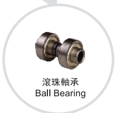
滾珠軸承 Ball Bearing