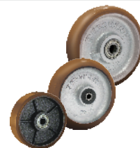
PU輪面可以變化硬度 Different PU tread hardness available