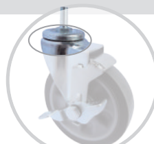
波盤防塵蓋 Swivel Dust Cover