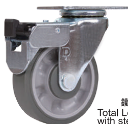
鐵雙刹 Total Lock Brake with steel Pedals