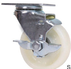
側煞 Side Lock Brake