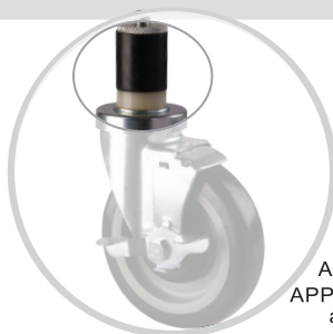
APP三件套 APP-Expanding adapters