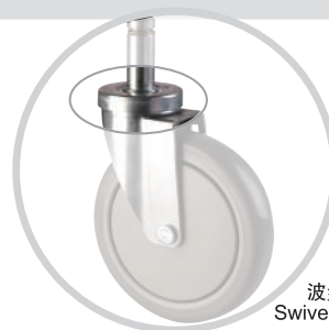
波盤防塵蓋 Swivel Dust Cover