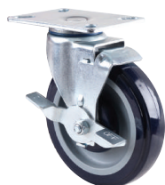
側剎 Side Lock Brake