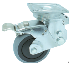
鋁剎 Total Lock Brake with Aluminum Alloy Pedal