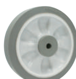
W全效輪 W Resolute Wheel