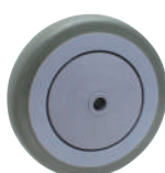
超級人造膠 TPR on PP Core