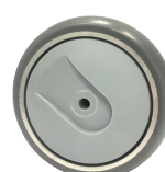
鋁芯AQP QPU on AL Core