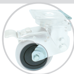
輪子可防塵蓋 Thread guard