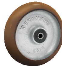
PU輪面可以變化硬度 Different PU tread hardness available