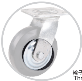
輪子可附防塵蓋 Thread guard