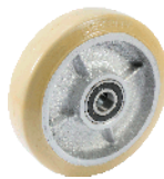
牽引NBR NBR Rubber on Cast