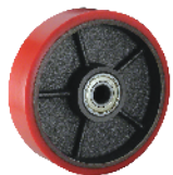
鐵芯聚氨酯 PU on Cast