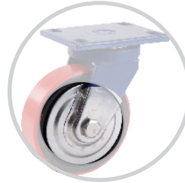
輪子可附防纏絲蓋(供選擇) Thread guard specially for textile industry(optional)