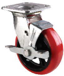
側剎 Side Lock Brake