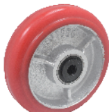
韓款PU輪 PU on Cast