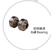
滾珠軸承 Ball Bearing