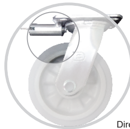
定向桿 Directional Lock