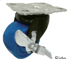
側剎 Side Lock Brake