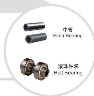
中管 Plain Bearing