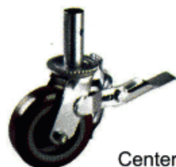
中剎 Center Lock Brake