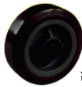
高科技耐磨聚氨酯 PU on PP Core