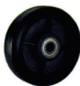
鐵芯NBR橡膠輪 NBR Rubber on Cast