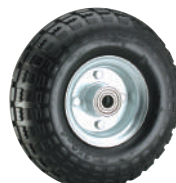
Solid Rubber wheel with plated steel rim