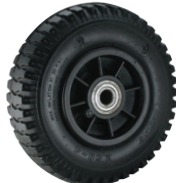
Pneumatic with plastic rim