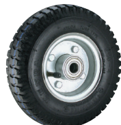
Pneumatic with plated steel rim