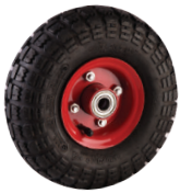
Pneumatic with painted steel rim