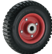
Solid Rubber wheel with painted steel rim