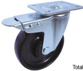
雙煞 Total Lock Brake