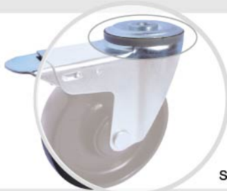
波盤防塵圈 Swivel Dust Cover