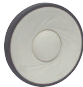
TPR on PP Core