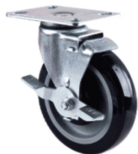
側剎 Side Lock Brake