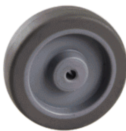
高科技耐磨聚氨酯 PU on PP Core