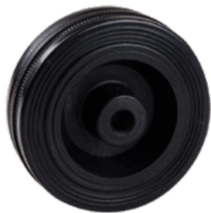
黑胎輪 Rubber on Plastic Core