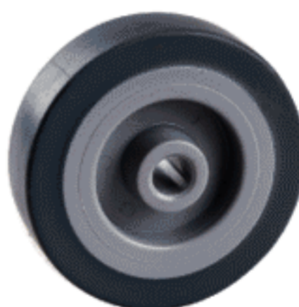
超級人造膠 TPR on PP Core