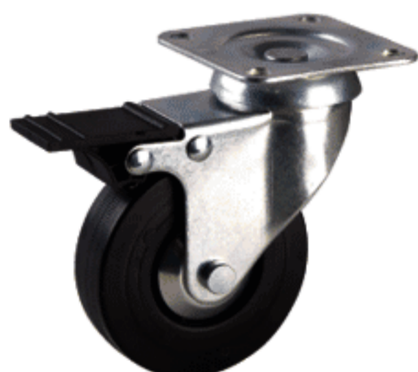
中刹 Center Lock Brake