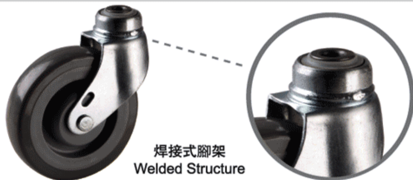
焊接式腳架 Welded Structure