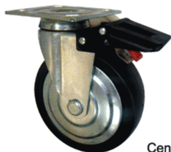
中剎 Center Lock Brake