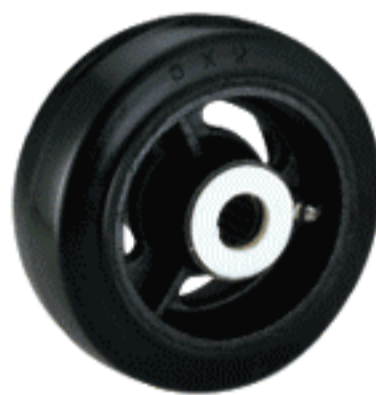
鐵芯NBR橡膠輪 NBR Rubber on Cast