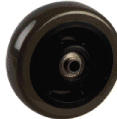
高科技耐磨聚氨酯(圓弧形) PU on PP Core (Round Shape)