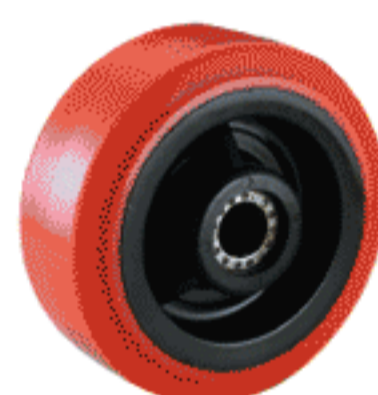
高科技耐磨聚氨酯 PU on PP Core