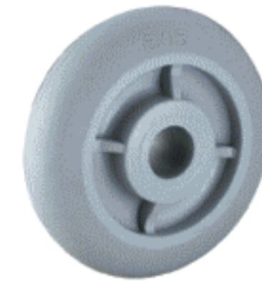
超級人造膠 TPR on PP Core