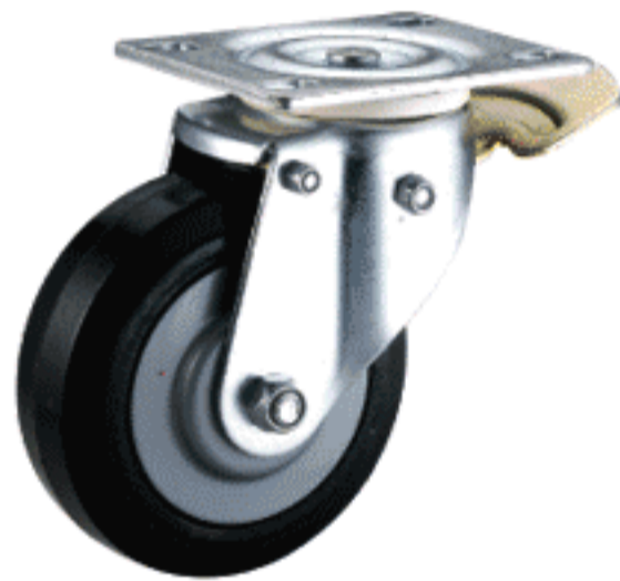
中刹 Center Lock Brake