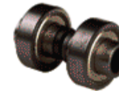
滾珠軸承 Ball Bearing

滾珠軸承僅適用於高科技耐磨聚氨酯(圓弧形) Only available for PU on PP Core(Round Shape)