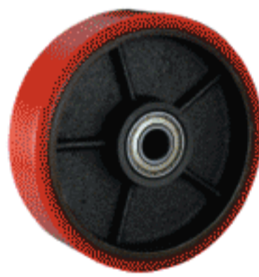
鐵芯聚氨酯 PU on Cast