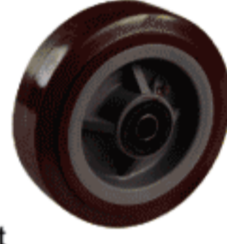
高科技耐磨聚氨酯 PU on PP Core