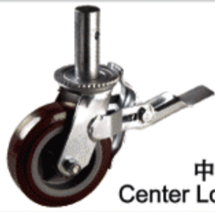
中剎 Center Lock Brake