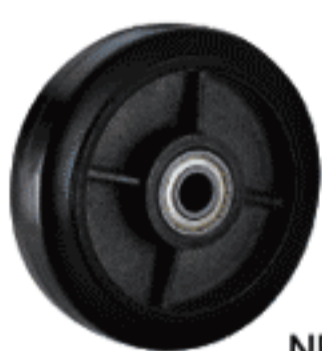
鐵芯NBR橡膠輪 NBR Rubber on Cast