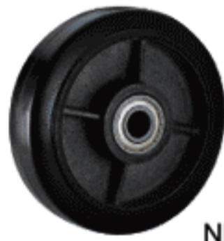
鐵芯NBR橡膠輪 NBR Rubber on Cast