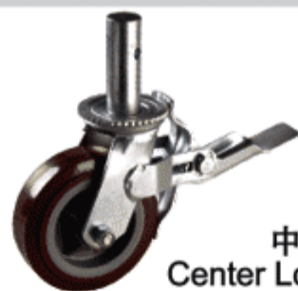
中剎 Center Lock Brake