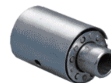
滾針軸承 Roller Bearing