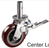
Center Lock Brake