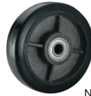
NBR Rubber on Cast