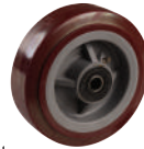
PU on PP Core