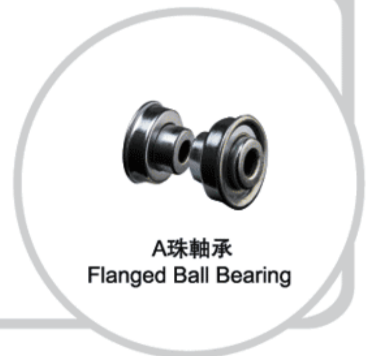
A珠軸承 Flanged Ball Bearing