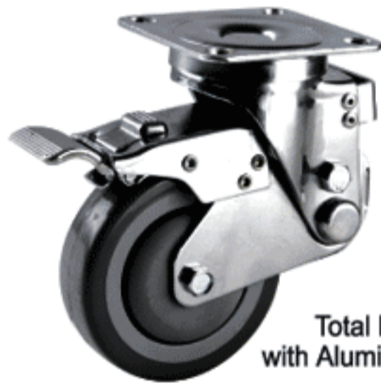
鋁制 Total Lock Brake with Aluminum Alloy Pedal