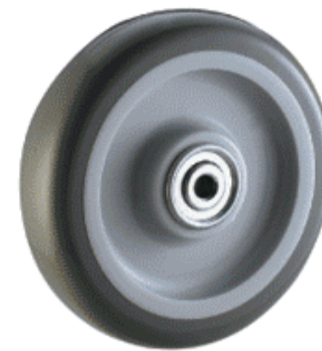
超級人造膠 TPR on PP Core