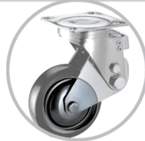
輪子可附防塵蓋 Thread guard