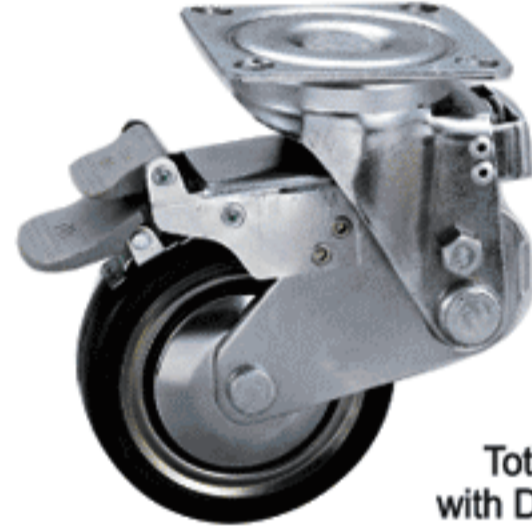
尼龍雙踏板 Total Lock Brake with Dual Nylon Pedals