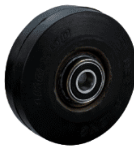
6" 鐵芯NBR橡膠輪 NBR Rubber on Cast