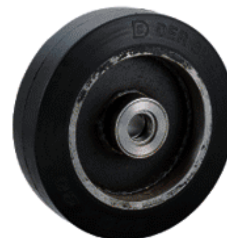
12" 鐵芯NBR橡膠輪 NBR Rubber on Cast