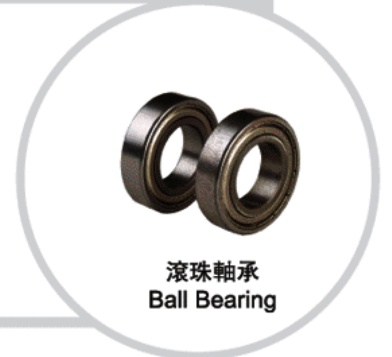
滾珠軸承 Ball Bearing