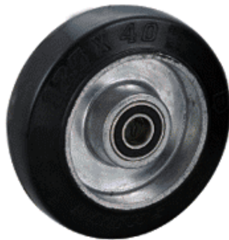
5" 鋁芯NBR橡膠輪 NBR Rubber on Aluminum Core