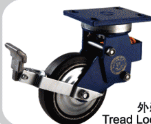
外剎 Tread Lock Brake