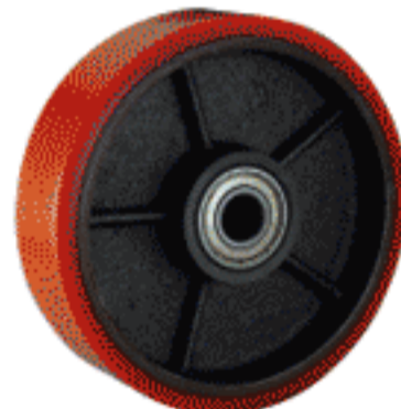
鐵芯聚氨酯 PU on Cast