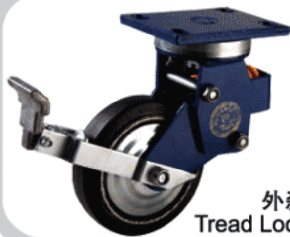
外剎 Tread Lock Brake