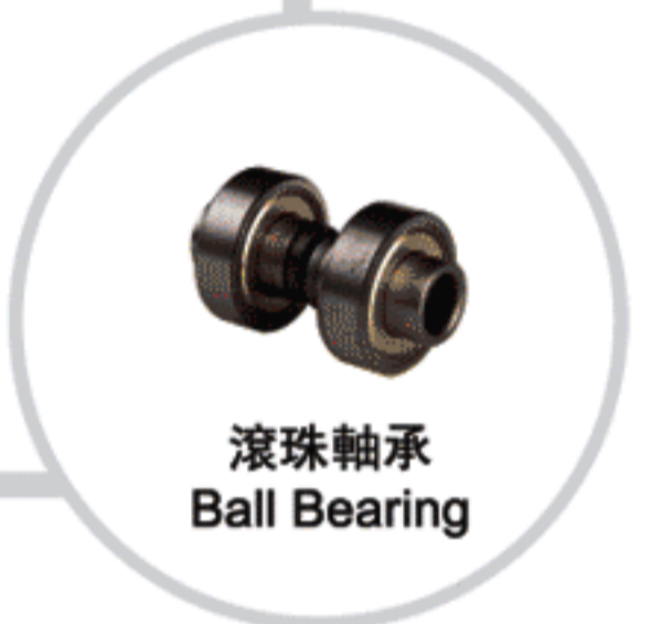
滾珠軸承 Ball Bearing