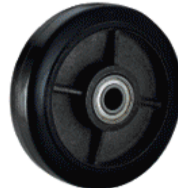
鐵芯NBR橡膠輪 NBR Rubber on Cast