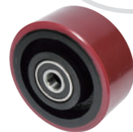
鐵芯XPU XPU on Iron Core