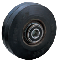
6"鐵芯NBR橡膠輪 NBR Rubber on Cast