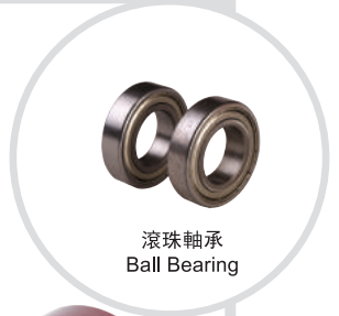
滾珠軸承 Ball Bearing