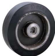
12"鐵芯NBR橡膠輪 NBR Rubber on Cast