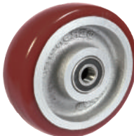
鐵芯VXP XPU on Iron Core