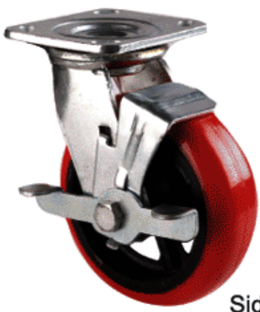
側剎 Side Lock Brake