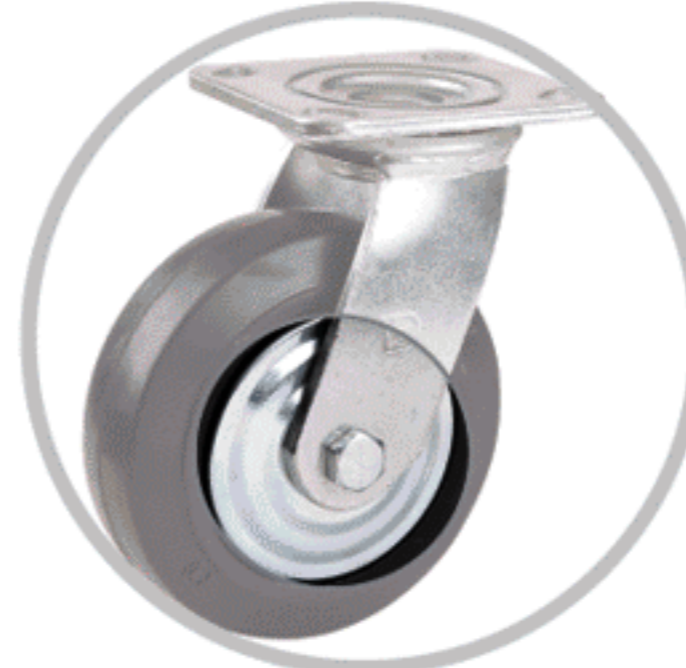
輪子可附防塵蓋 Tread guard