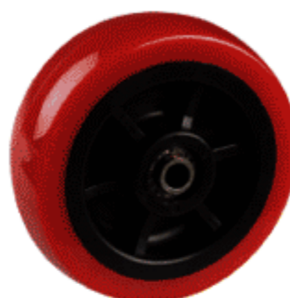
高科技耐磨聚氨酯 PU on PP Core