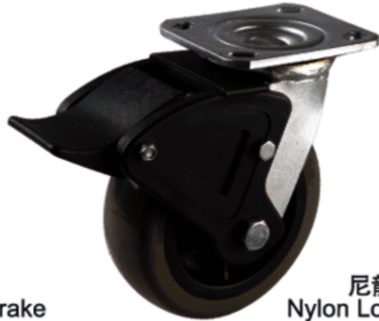
尼龍剎 Nylon Lock Brake