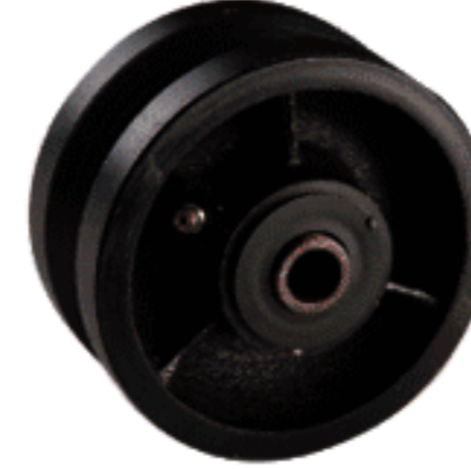
VG輪 V Groove