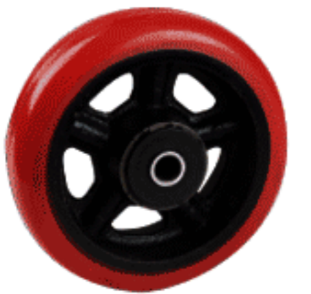
鐵芯聚氨酯(圓弧形) PU on Cast (Round Shape)