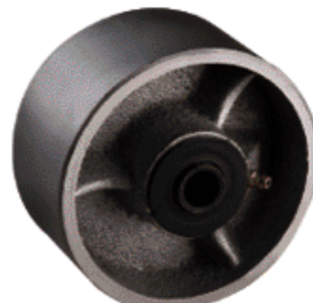
SS鐵輪 Cast Iron