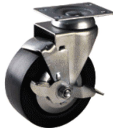
側刹 Side Lock Brake