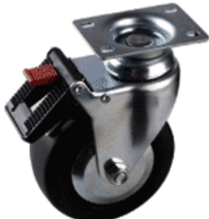
中刹 Center Lock Brake