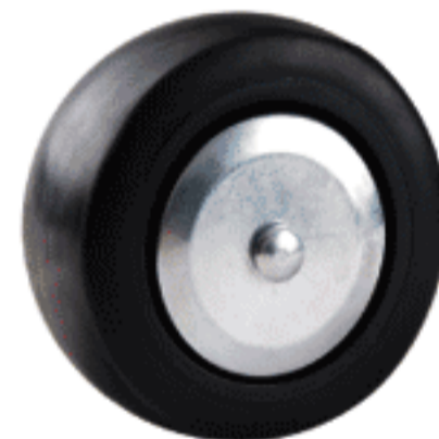
超級人造膠 TPR on PP Core