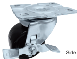
Side Lock Brake