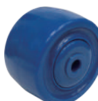
King Kong Wheel