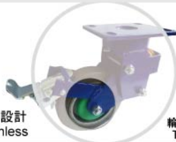
輪子可耐防塵蓋 Thread guard