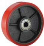
鐵芯聚氨酯 PU on Cast