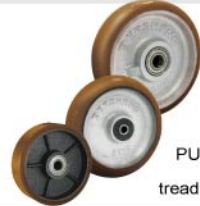
PU輪面可以變化硬度 Different PU tread hardness available