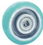
環保NBR橡膠輪 Non-marking Rubber on Cast