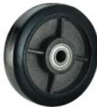
鐵芯NBR橡膠輪 NBR Rubber on Cast