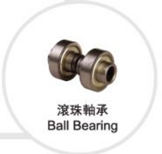
滾珠軸承 Ball Bearing