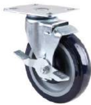
侧刹 Side Lock Brake