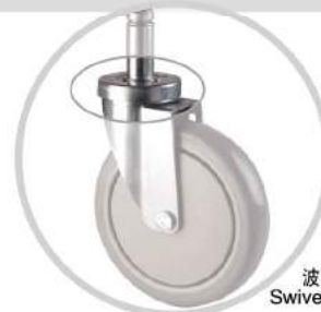
波盘防尘盖 Swivel Dust Cover