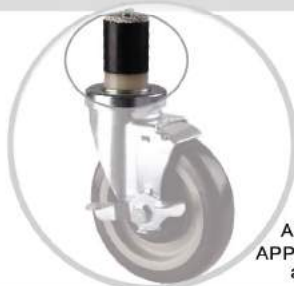
APP三件套 APP-Expanding adapters