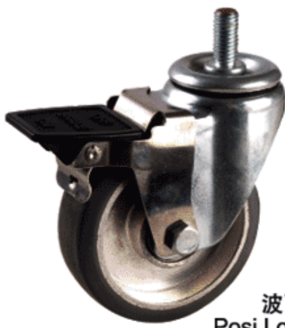
波西剎 Posi Lock Brake