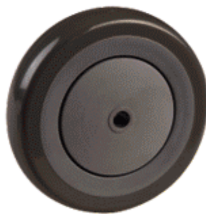
高科技耐磨聚氨酯 PU on PP Core