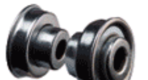
A珠軸承 Flanged Ball Bearing