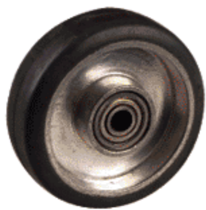
鋁芯橡膠輪 Rubber on Aluminum Core