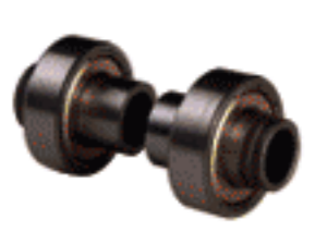
滾珠軸承 Ball Bearing