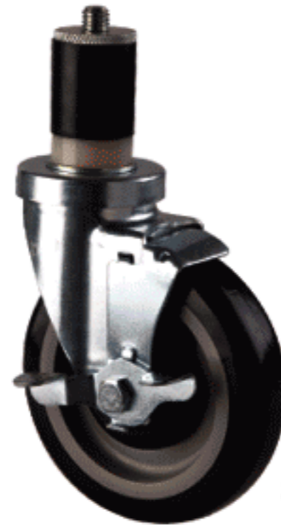
側剎 Side Lock Brake