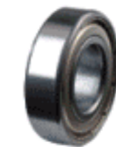
滾珠軸承 Ball Bearing