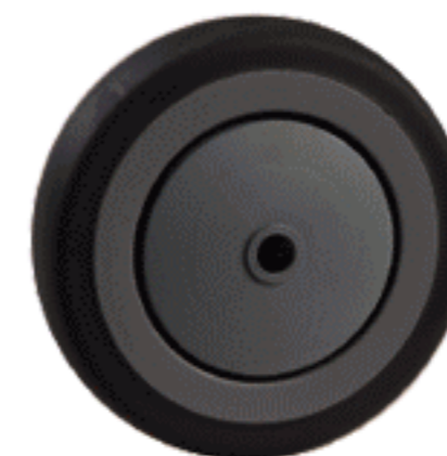
超級人造膠 TPR on PP Core