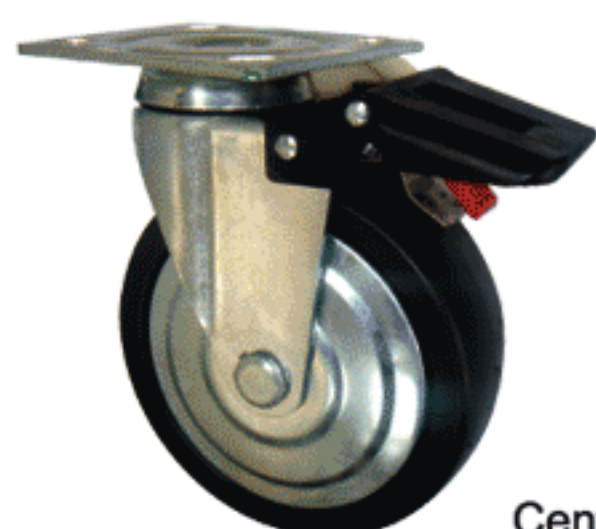
中剎 Center Lock Brake