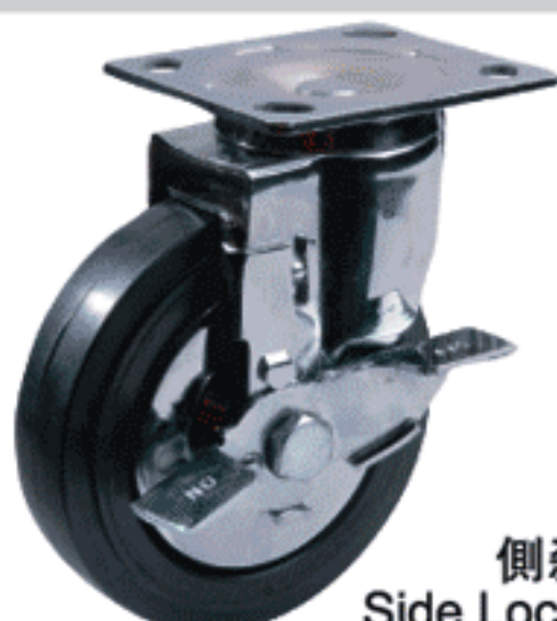
側剎 Side Lock Brake