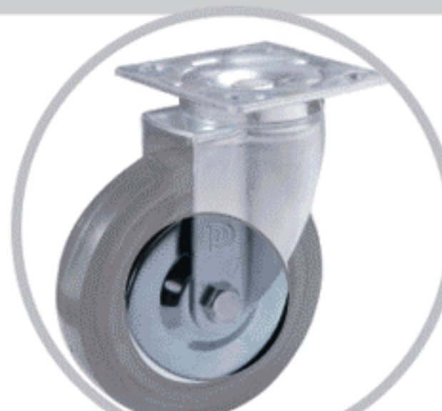
輪子可附防塵蓋 Tread guard