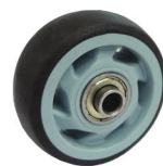
超级人造胶 (风火轮) TPR on PP Core