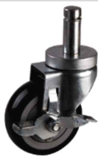
側剎 Side Lock Brake