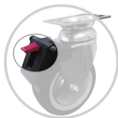
前刹(双踏) Center Lock Brake(double pedals)