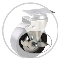
侧刹 Side Lock Brake