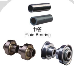
中管 Plain Bearing 滚珠轴承 Ball Bearing A珠轴承 Flanged Ball Bearing