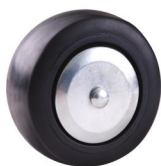
超级人造胶 TPR on PP Core