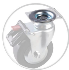
反球碗 Extra Clearance Between Top Plate and Body