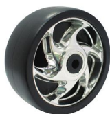
风火轮 Designed PP Wheel