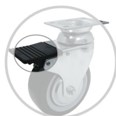
前刹(单踏) Center Lock Brake(single pedal)