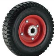
風硬輪(烤漆鐵框) Solid Rubber wheel with painted steel rim