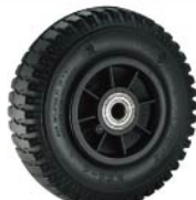
風輪(塑框) Pneumatic with plastic rim