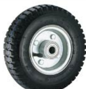
風輪(鍍鋅鐵框) Pneumatic with plated steel rim