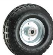
風硬輪(鍍鋅鐵框) Solid Rubber wheel with plated steel rim