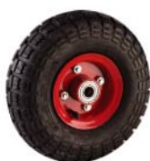
風輪(烤漆鐵框) Pneumatic with painted steel rim