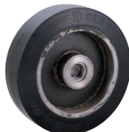
12"鐵芯NBR橡膠輪 NBR Rubber on Cast