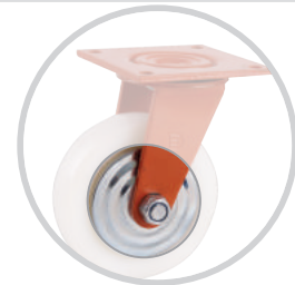
輪子可附防塵蓋 Thread guard