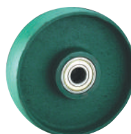
銑輪 Cast Iron