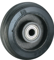
三星輪 Rubber on Cast