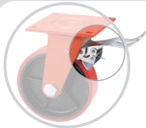
BCD煞(中煞) Swivel W/Center Lock Brake