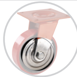
輪子可附防纏絲蓋 Thread guard specially for textile industry